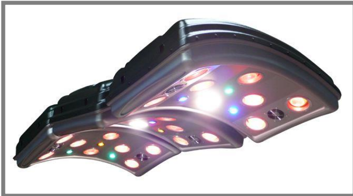
MaXuSS Thera 230 / MaXuSS Thera 400